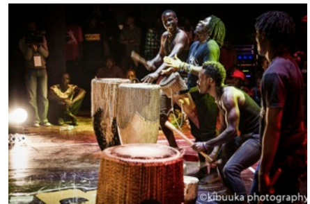
Introductory top rock and Afrika Arts Kollektive musical instrument workshop, Afro House eliminations and Makerere University Drummers